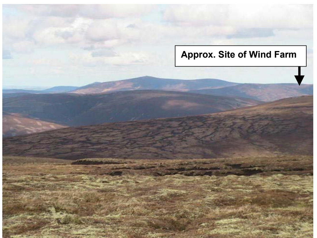
Fig 2 View towards 'The Buck' (conical hill centre) from Meikle Corr Riabhach showing site for windfarm.